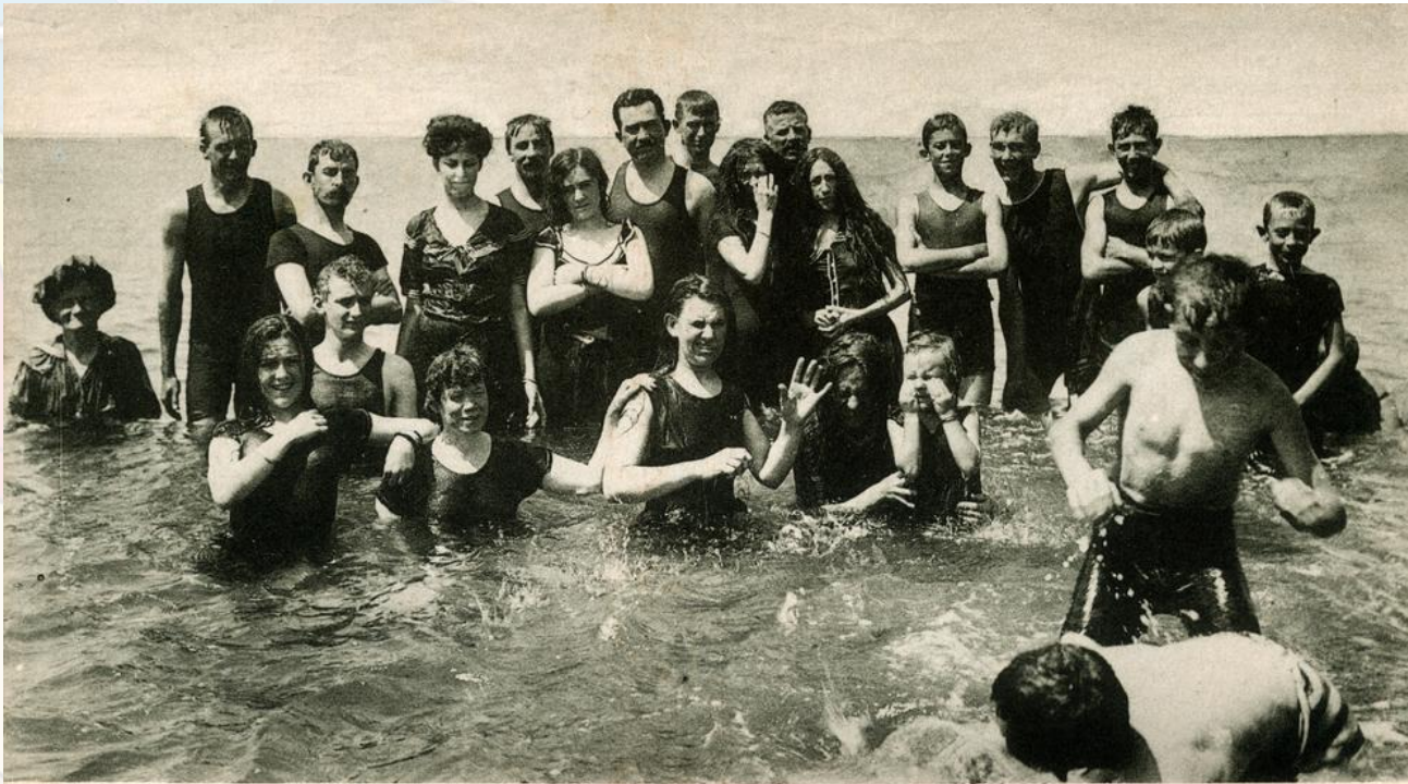
Mixed Bathing, Redcliffe, Qld.

Sunbathing wasn't in fashion back then, so Victorians would go to the beach fully clothed. 'Sea bathing' was done instead.